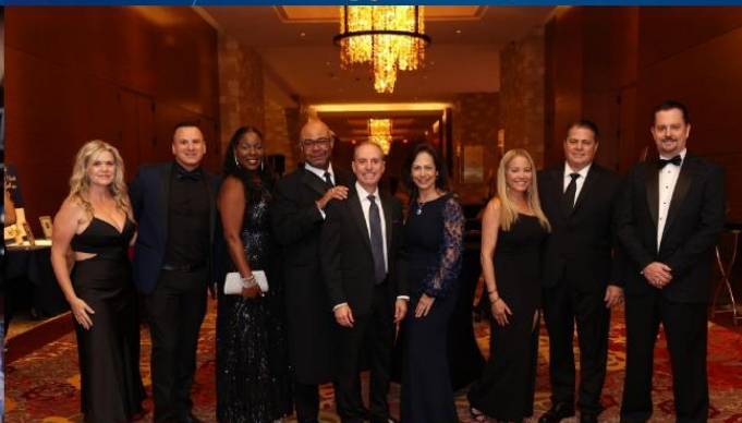
10TH ANNUAL Broward Health Ball