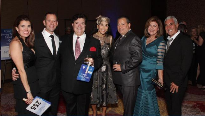
10TH ANNUAL Broward Health Ball