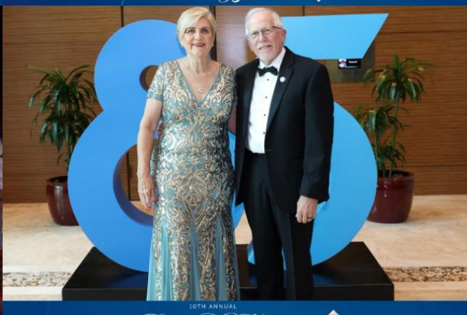
10TH ANNUAL Broward Health Ball