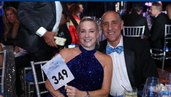
10TH ANNUAL Broward Health Ball