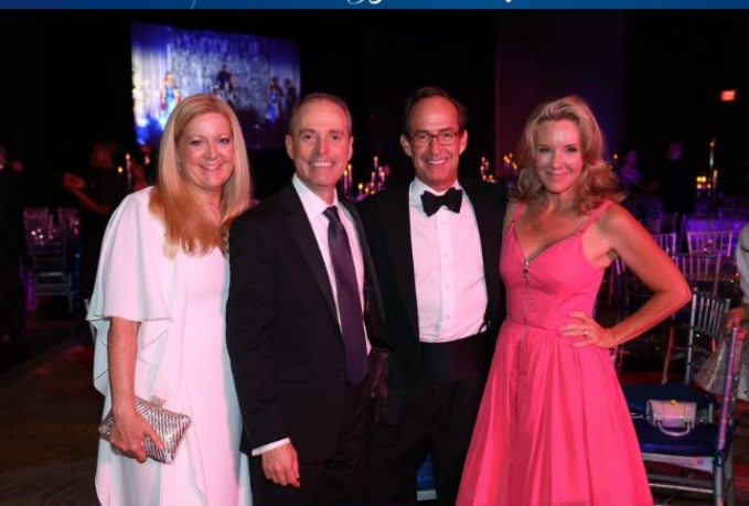
10TH ANNUAL Broward Health Ball