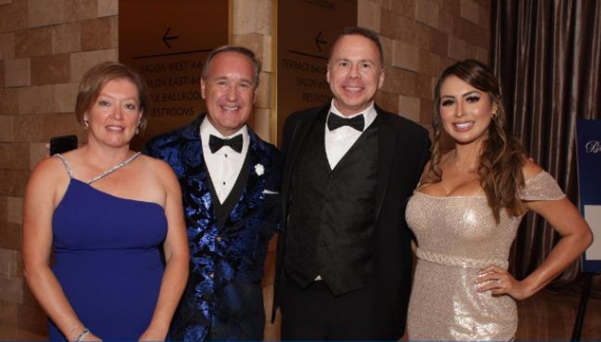
10TH ANNUAL Broward Health Ball