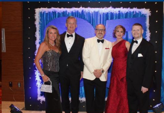
10TH ANNUAL Broward Health Ball