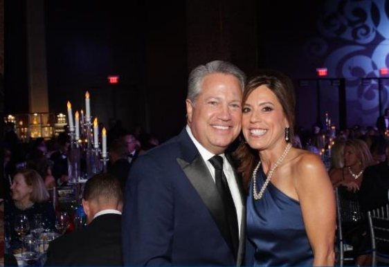
10TH ANNUAL Broward Health Ball